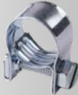
Nut & Bolt Clamps