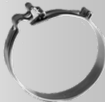
NORMA Cobra Crimped Clamps