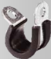
Rubber Cushion Clamps