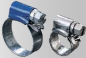
ABA Nova Embossed Band Clamps

ABA / NORMA are the long-term European leaders in hose clamps, connectors and fluid system technologies. Together, we are the global providers of extensive and diversified lines of complementary clamping products with an established reputation for innovation, engineering and total product reliability.